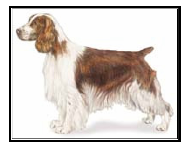
SPANIEL, WELSH SPRINGER