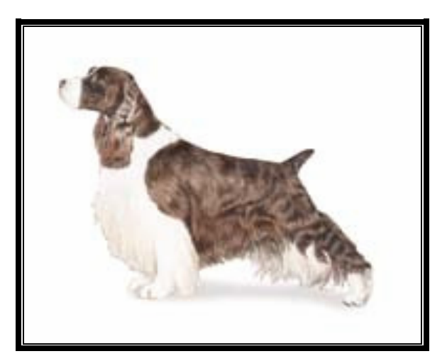
SPANIEL, ENGLISH SPRINGER

HEAD : MUZZLE 2/3<sup>RDS</sup> OF SKULL, TAPERS HORIZONTALLY & VERTICALLY; LIPS TIGHT AND DRY; EARS SET ABOVE EYE LEVEL, SHORT & TRIANGULAR